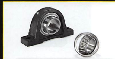
BEARINGS & BEARING UNITS