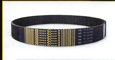
TIMING BELTS & PULLEYS