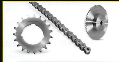
ROLLER CHAIN & SPROCKETS