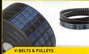
V-BELTS & PULLEYS