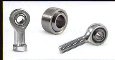
ROD ENDS & SPHERICAL BEARINGS